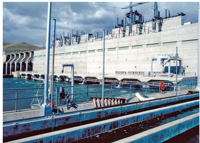
Little Goose Dam — capacity 810 megawatts, energized in 1970

The most technically and economically feasible generation replacement for the lower Snake River dams would likely be natural gas turbines. New natural gas generators could increase transmission congestion depending on their location, and would likely require additional transmission